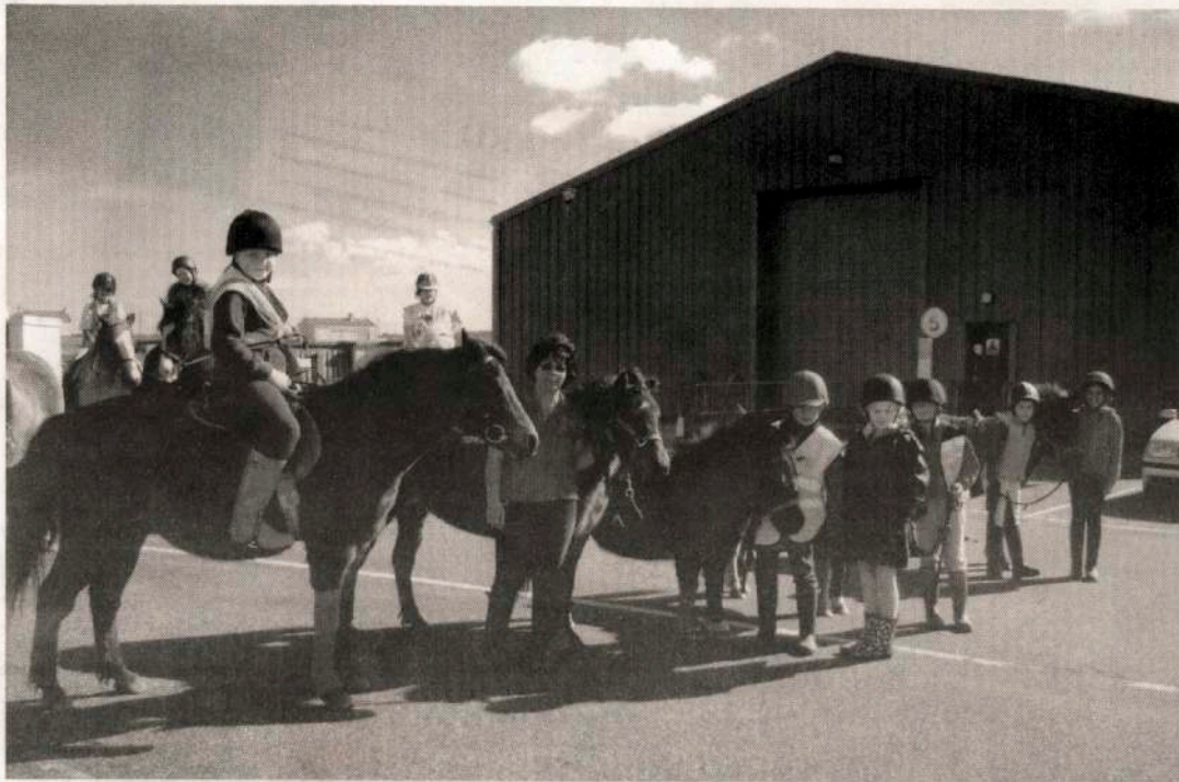
Over £400 was raised by the riding school on behalf of Sport Relief. As little as £5 can buy new clothes for a child living or working on the street.